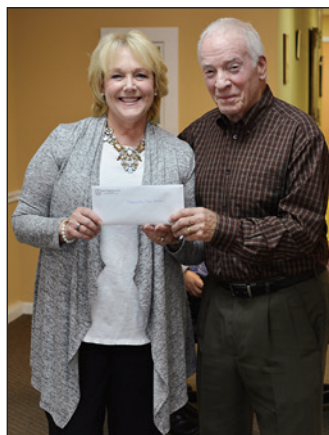
Senior Citizens Services grant award presented to Clearwater Free Clinic supporting Behavioral Health Program