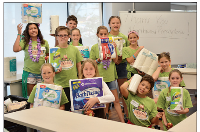
Northwood Presbyterian kids collect donations for the Clearwater Free Clinic