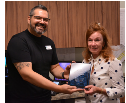
Kathy Ronan Above and Beyond Award